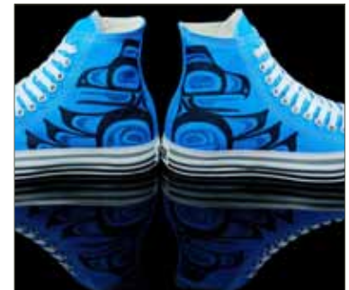
PHOTOS, top to bottom: Model Train Festival, 2009 (Christopher Nelson Photography). Featured in Fast Moving Water (Keith Lazelle). Ezra Meeker's wagon, featured in Icons of Washington History (Washington State Historical Society). Lovebirds Eagle and Raven, 2010, In the Spirit: Contemporary Northwest Native Arts Exhibit (Sondra Simone Segundo).