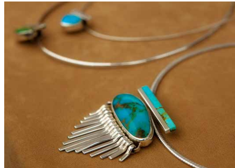
TOP: Poster image from Icons of Washington History. (Washington State Historical Society) BOTTOM: Jewelry on display during In The Spirit: Contemporary Northwest Native Arts Exhibit. (Washington State Historical Society)